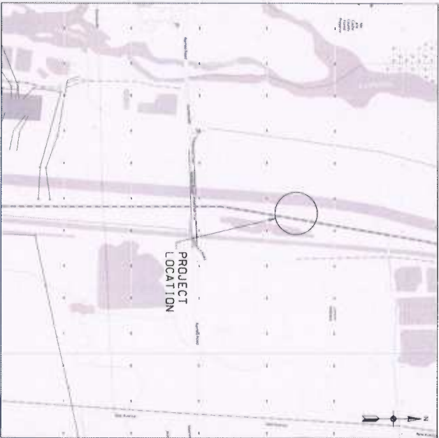
LOCATION MAP (N.T.S.)