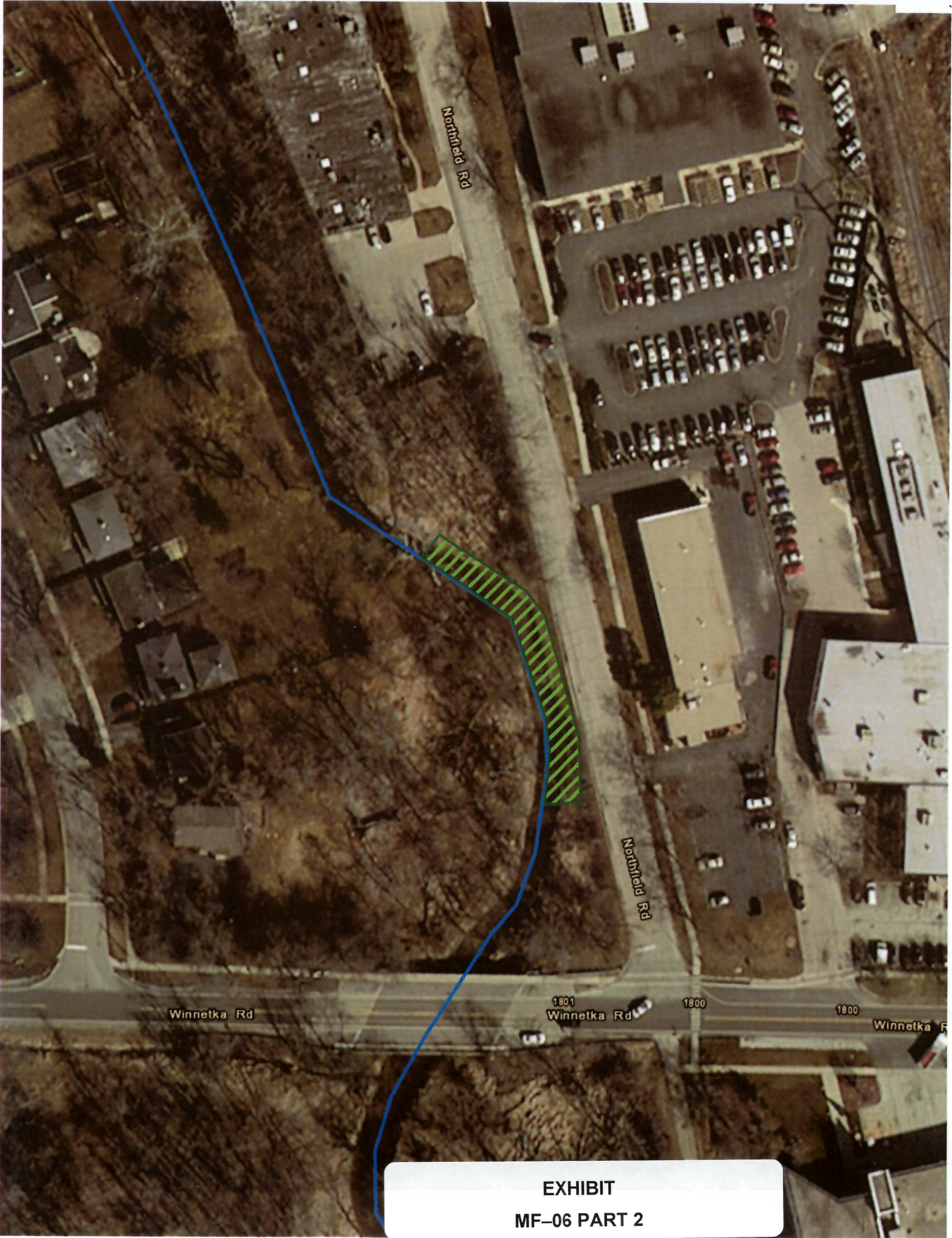
EXHIBIT MF-06 PART 2