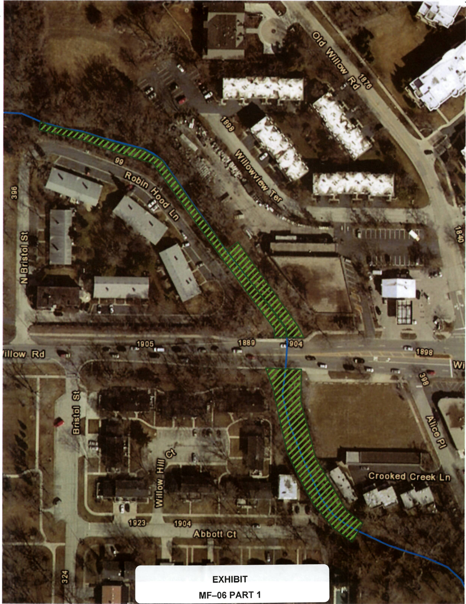
EXHIBIT MF-06 PART 1