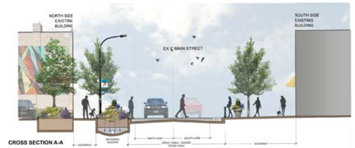
CROSS SECTION A-A