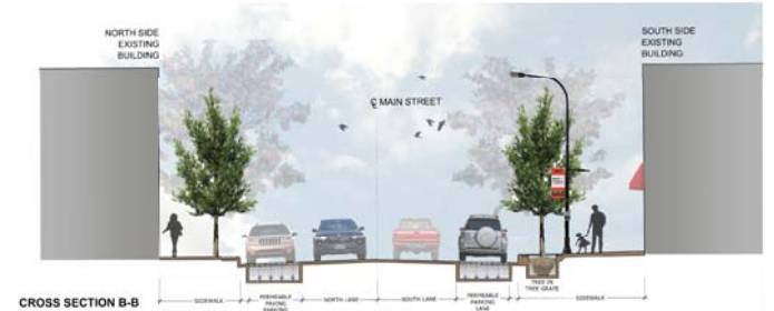
CROSS SECTION B-B