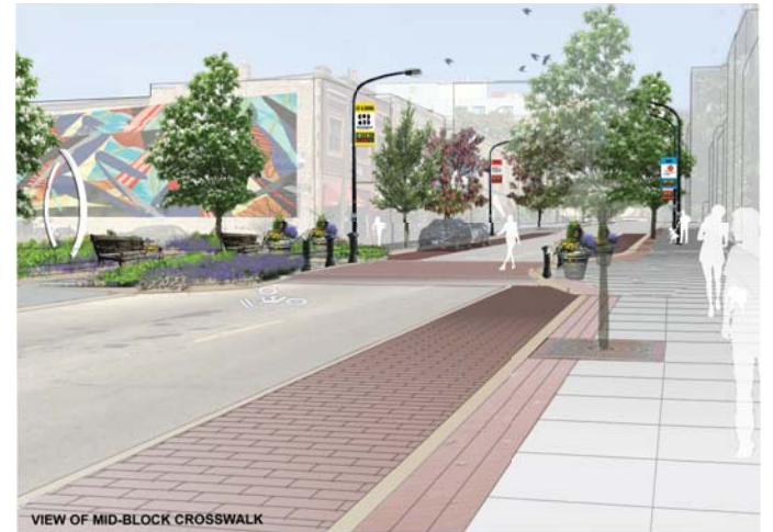
VIEW OF MID-BLOCK CROSSWALK