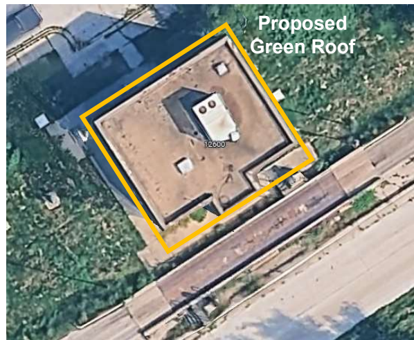
Contract 25-612-21 Calumet Water Reclamation Plant (CWRP) Building 62: CALSMA East Scale House