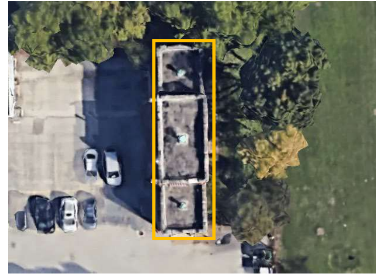
Contract 25-612-21 O'Brien Water Reclamation Plant (OWRP) Building 2: Emergency Generator Building