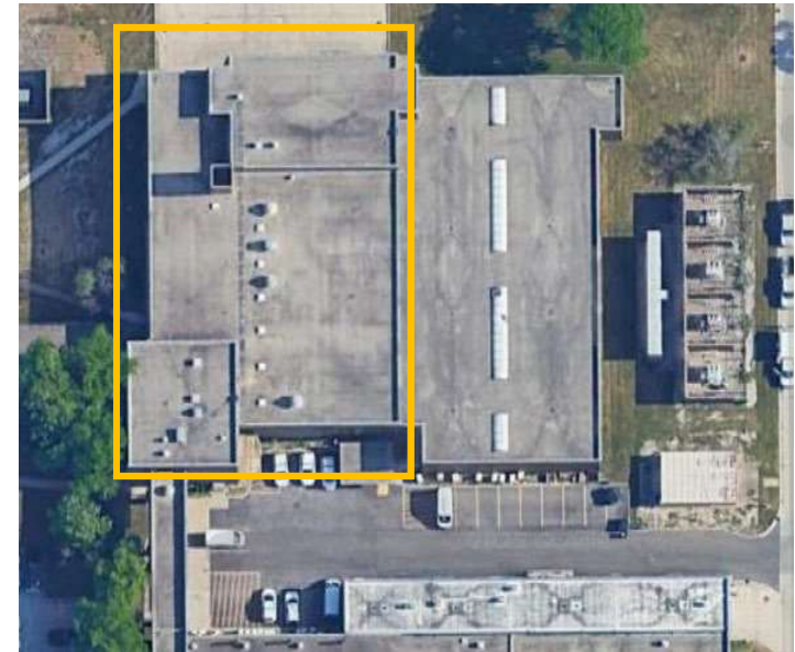
Contract 25-612-21 Kirie Water Reclamation Plant (KWRP) Building 3: Pretreatment Building