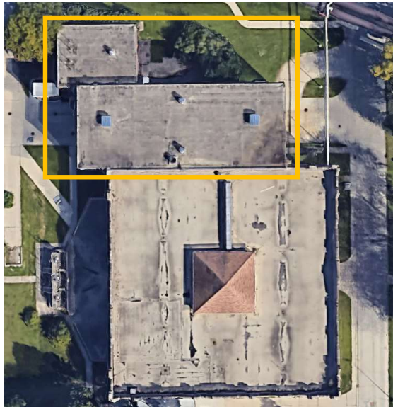
Contract 25-612-21 O'Brien Water Reclamation Plant (OWRP) Building 4: Grit Chamber Building Loading Building & Scum Building