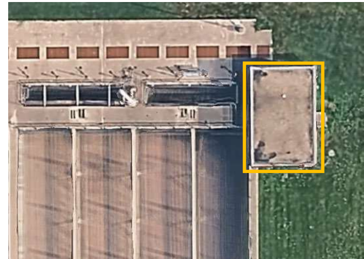
Contract 25-612-21 Calumet Water Reclamation Plant (CWRP) Building 46: Gallery Access Building