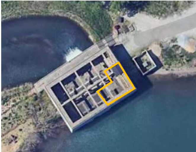
Contract 25-612-21 Calumet Service Area SEPA 1 Electrical and Storage Building