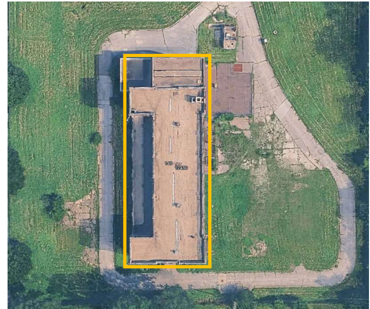
Contract 25-612-21 Calumet Service Area 125 th Street Pumping Station