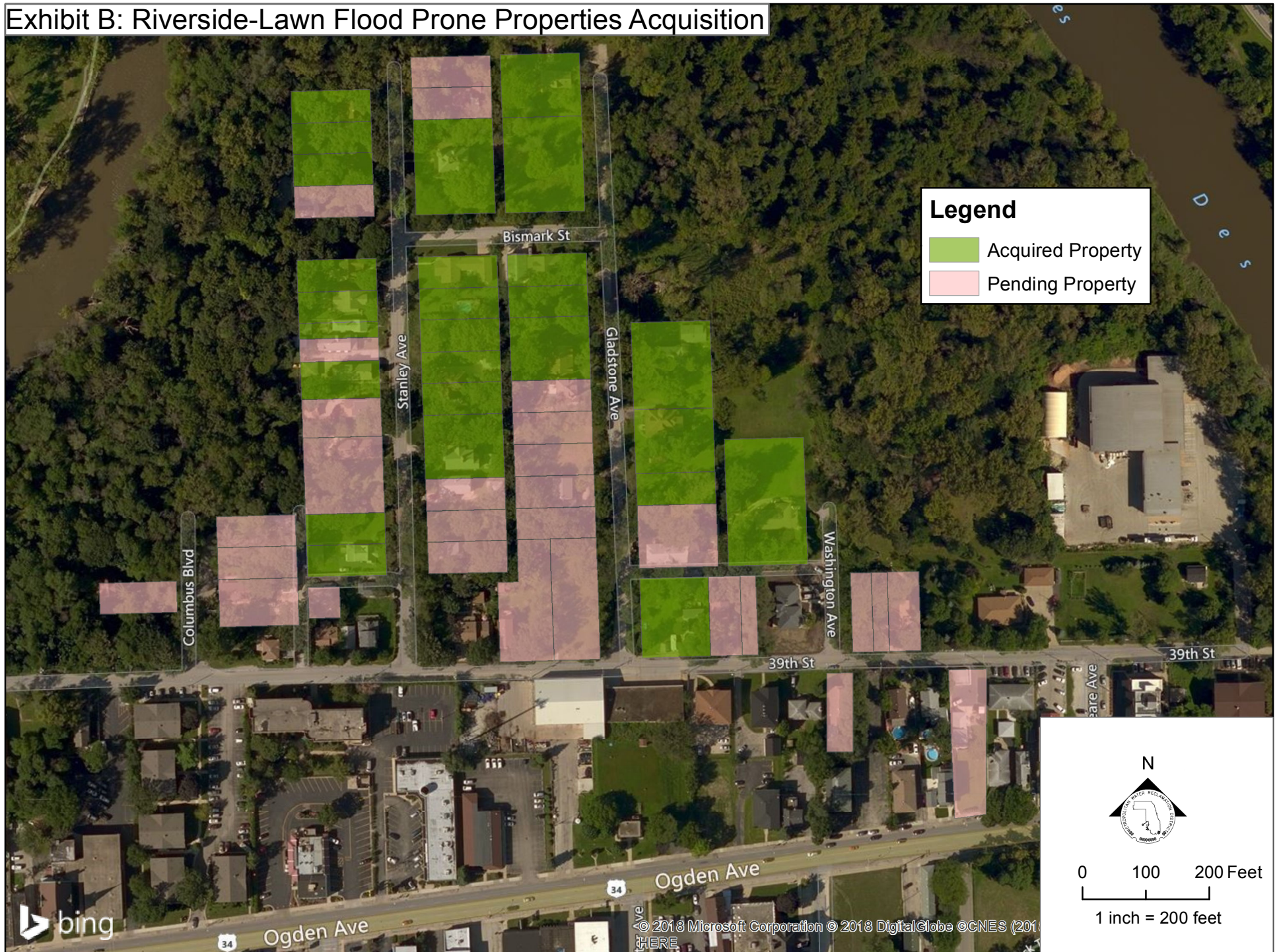
Exhibit B: Riverside-Lawn Flood Prone Properties Acquisition